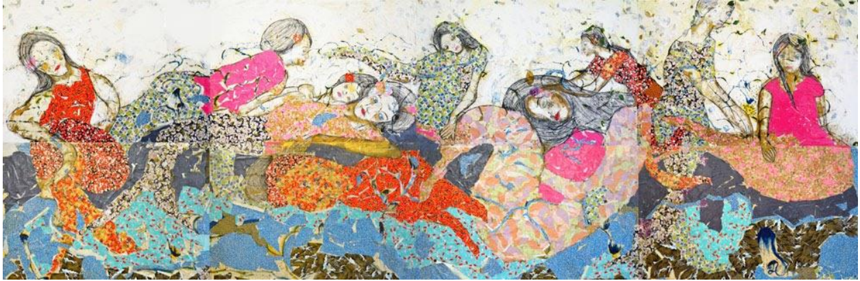
María Berrio (Colombia/USA) Sea of Mermaids / Mar de Sirenas (2012)